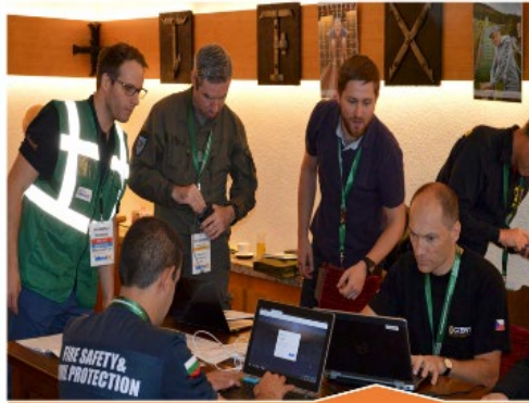
Civil Protection Authorities Emergency Services Civil-Military Assistance