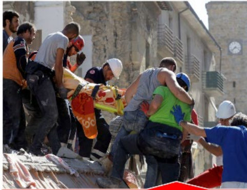
NGO's Charities Informal Groups