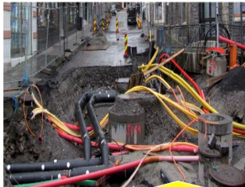
Utilities Infrastructure Provider Private Companies